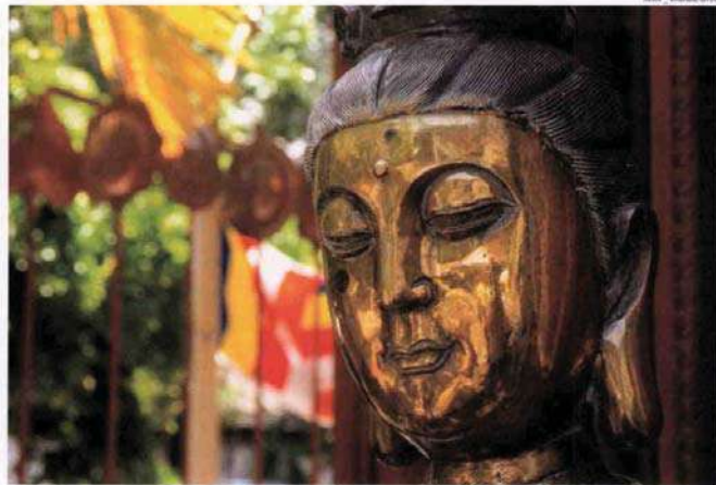
Buddha awaits Gangaramaya Temple, Colombo, above

Journey to La Digue to take a leisurely bike ride through the picturesque roads of the island to reach Anse Source d'Argent, allegedly the most photographed beach in the world with its distinctive rocks and pure white sand. Then on your way back to the ferry, stop off at Fish Trap Restaurant & Bar to